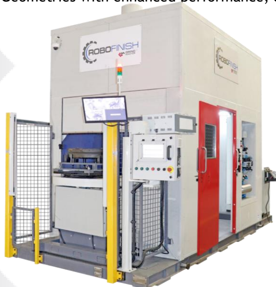
ROBOFINISH Robotic Grinding Machine www.grindmaster.co.in © Grind Master Machines Pvt. Ltd

GRINDMASTER is a known name in surface finishing - providing turn-key solutions of specialized machinery, including micofinishing, metalfinishing and deburring. GRINDMASTER has developed ROBOFINISH Robotic machines for Grinding/Fettling/Deflashing and Finishing Ferrous and Non-Ferrous Castings with Complex Geometries with enhanced performance, quality and quick ROI